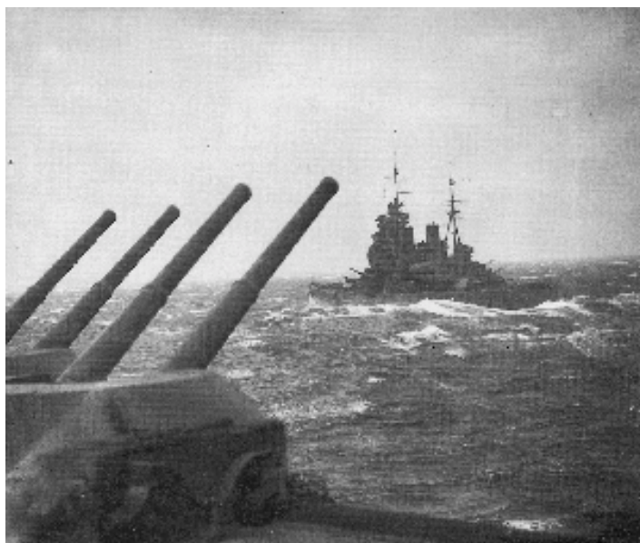
British battleships succeed at Cape Matapan

The Royal Navy reported the loss of several light cruisers and some light damage on their ships. "The British are never lame to retaliate", read a note from the British ambassador Sir Lionel Porridge to the Italian authorities at Rome before he took a plane to London. The British have retracted their embassy personnel from Italy and ejected Italian diplomats, arrested all Italian citizens in Commonwealth territories.