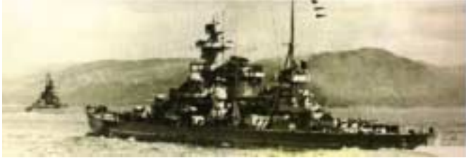
Gneisenau following sister ship Scharnhorst on Atlantic breakthrough before splitting course

German battlecruiser Gneisenau destroyed a French convoy near Dakar. The escort provided by three French cruisers soon collapsed after the Marseillaise took a direct hit from the German heavy artillery. French cruiser Georges Leygues escaped undamaged.