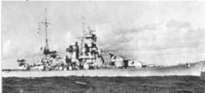
Scharnhorst was the queen of Kriegsmarine's ocean fleet

The British admiralty has released a detailed report on the sinking of the Scharnhorst, the German battlecruiser that broke through the the Denmark Straits last month, together with sister ship Gneisenau and three German 'pocket battleships' of the Graf Spee class.