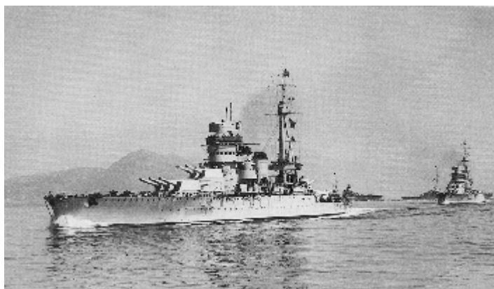
Conte diCavour on her last mission

After their successful strike on Port Said, the Italian Fleet was chased by the larger British fleet stationed at Alexandria. Only 36 hours after their strategic retreat to protect their supply lines to the landed troops, British cruisers spotted the main fleet near Cape Matapan. After several day and night battles, the British sank two Italian battleships, the Leonardo da Vinci and Conte di Cavour plus more than eight cruisers of the national hero Guiseppe Garibaldi Class.