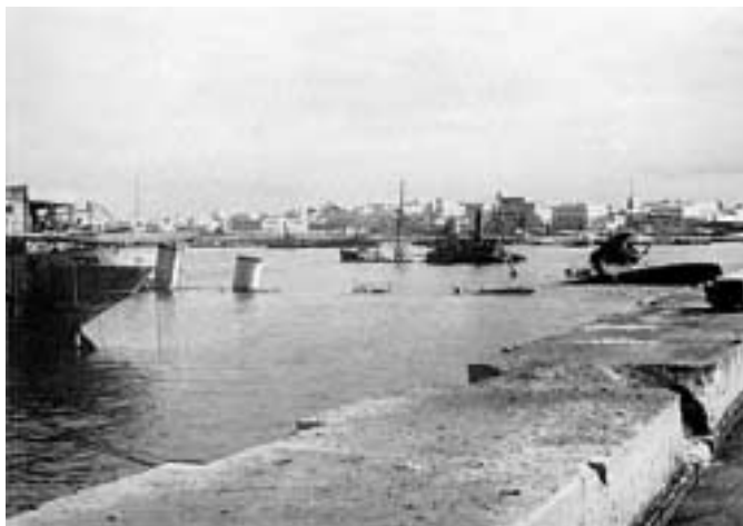
Port Said after it was captured by Italian troops

Tensions between the two European powers increased with the strict search policy of Italian merchant ships at Suez canal en Britain declared closing of the waterway for Italian arms and warships.