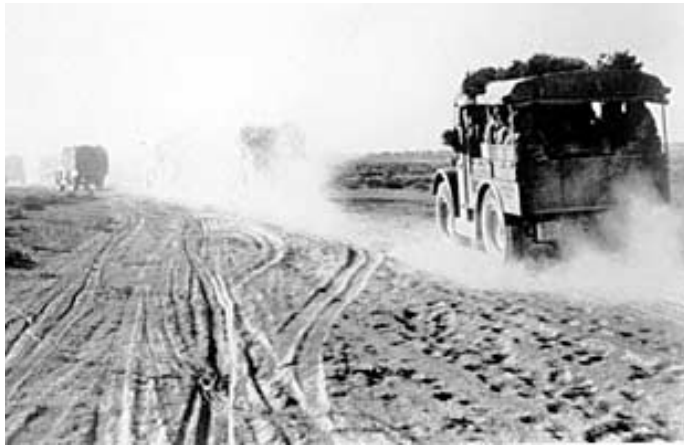
Italian troops on the advance

In a combined naval, air and land assault on the British controlled kingdom of Egypt, Italy delivered a hard blow to the Commonwealth. While Italy's land offensive along the Mediterranean coast towards Alexandria could be contained by a delaying action fight by the British 8 th Army, the amphibious landing of 3 Italian corps at Port Said could not be prevented.