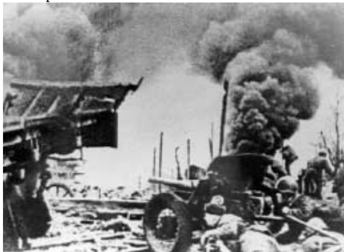
Russian troops advance on Wyborg

The Russian main force in Karelia, consisting of the 1 st Red Tank army with over 2,000 tanks and six infantry corps attacked the two Finnish corps defending the city since January. Russia prepared her offensive with a massive aerial bombardment and a two-day artillery barrage. Intense fighting also occurred in the air, where the Russians managed to achieve air superiority over the new Combined Scandinavian Airforce. A heated battle was also reported in the Baltic between Russian and Swedish warships.