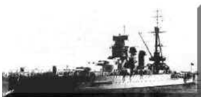
Andrea Doria (archive picture)

Italian battleship Andrea Doria reportedly steamed up and down the Indian ocean, unhindered by the Royal Navy and wreaked havoc upon British cargoes bound for Europe. The Andrea Doria was officially on a people's friendship visit mission to Japan before war broke out.