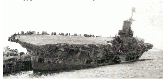
HMS Ark Royal, the star of Britain's carrier fleet, fell victim to the Italian surprise strike

Italian dictator Benito Mussolini, who made his inclination towards Britain's war opponent Adolf Hitler all too obvious last month, tried to convince the world that his action is not to be seen as taking side for Germany but purely an Italo-British dispute over Egypt and the channel rights.