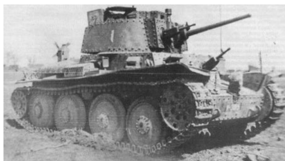
Both Hungary and Romania maintain a small arsenal of modern armored fighting vehicles

The creation of these states had satisfied many national aspirations, but numerous minority and territorial problems were left unsettled, and both Italians and Germans were able to turn them to their own advantage. Among the dissatisfied were the Hungarians in the part of north central Yugoslavia that had once been part of the Austro-Hungarian Empire; the Italians along Yugoslavia's northwestern border; the Macedonians, torn among the Bulgarians, Yugoslavs, and Greeks; and the large colonies of Austrians and Germans in northern Yugoslavia. There were also bitter rivalries between member nations of the same state, as the Serbs and Croats of Yugoslavia, and both Yugoslavia and Bulgaria were resentful of Greek possession of the Aegean coast. Despite the efforts of some Balkan leaders to foster intra-Balkan cooperation and good will prior to 1941, these sources of animosity and friction remained to hamper resistance to Italian and German subjugation.