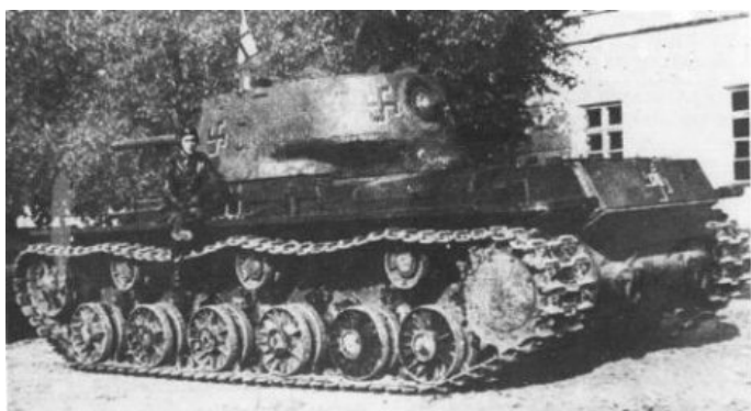
The Scandinavian tank forces solely comprise of a handful of captured Russian armored vehicles

Soviet forces of Yeremenko's Northern Front advanced through Scandinavia to border of Sweden. The 1 st and 2 nd Tank Corps along with 1 st Mot. Rifle Corps attacked the last Finnish city of Oulu on August 16, 1941. The defending forces performed an orderly retreat behind the river Oulujoki, blowing the bridges just before the Soviet could seize them. The 1 st Mechanized and 25 th Rifle Corps outflanked the 1 st Swedish Division to the north-east, threatening to pocket the entire Scandinavian force next month, if weather permits. Sweden is now within reach of Russian forces.