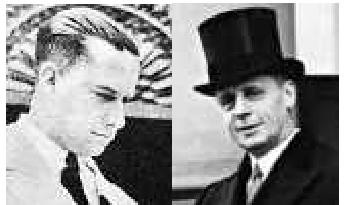
Left: Count Ciano, right: Joachim Ribbentrop

Following intensive talks with Italian foreign minister Count Galeazzo Ciano in July and his German counterpart Reichsaussenminister Joachim Ribbentrop this month, the kingdoms of Hungary, Romania and Bulgaria succumbed to the Italo-German pressure to join their alliance for world conquest. Not without self-interest, for sure - we shall see how militarism has a long tradition in the Balkan states. The Italian Duce has planned this move for months but Berlin’s strong man was seemingly fickle until recently. What role the Russian move or the US war entry plays can only be guessed.