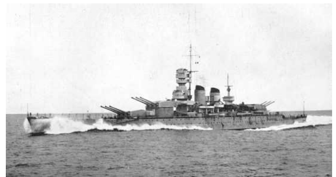
Battleship Littorio engaged in shore bombardment against the British 1 st Infantry Corps

An Italian task force lead by the new Italian battleship Littorio bombarded the British supply lines from off the shore. The British forces had no choice but to withdraw from the small town. The German army has therewith successfully relieved the besieged Italian colony Tripolis with their hastily assembled forces in Africa.