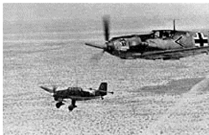
German "Stuka" dive bomber escorted by a Me-109 fighter over the Algerian desert

On 1st August 1941, a German Fallschirmkorps conducted an airborne assault at the port city of Boné, Algeria. The first wave of paratroopers was tasked to secure the RAF airfields.