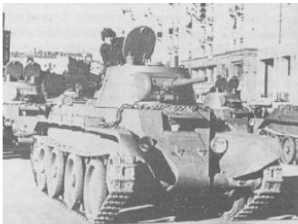
Soviet tanks in Batum, before the invasion

The central Front under Marshal Zhukov extended its beachhead around Sinop to the west. A parachute corps was brought into the town from the Crimea, and the forces invading Turkey from the Caucasus joined the landing forces of Sinop near the river Kisil Irmak. In south-eastern Turkey a Soviet Mountain Corps engaged Turkish forces near Diyarbakir.