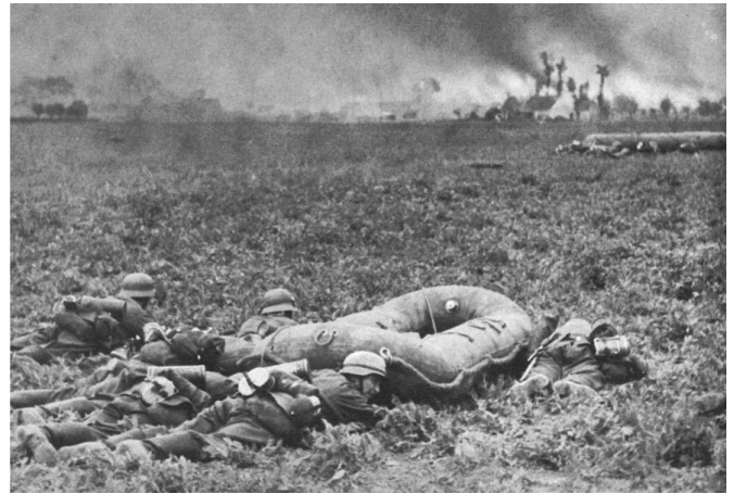
German troops after crossing the river Maas

The XLII Armeekorps lead the way to secure Arnhem. XXIII and X corps tried to reach The Hague as quickly as possible but failed to execute the maneuvers fast enough to prevent Dutch border garrisons blowing the bridges over the Meuse. In the second half of August the German forces moved to surround Amsterdam with three corps each to the south and south-east. Amsterdam is since besieged with all forces.