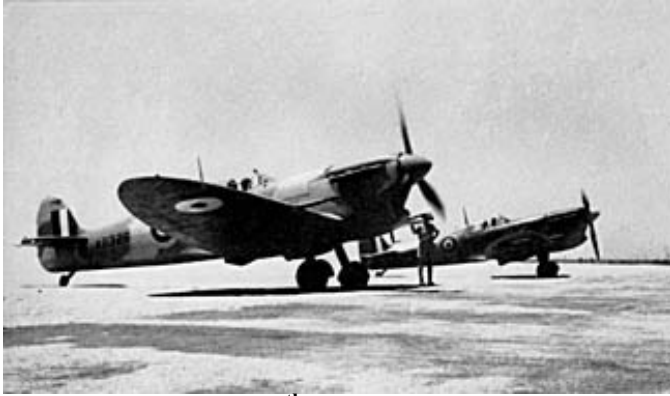
Spitfires from the 85 th Fighter Wing

By 4th of August the German forces completely secured the airfield. The rest of the corps was then directly flown into the airfields to deploy until 7th of August. At the same time an Italian assault fleet sailed out from Taranto, carrying German troops on its way to Bone. At 10th of August the I. Fallschirmkorps secured Bone port. On the next day the assault fleet arrived at Bone, beginning immediate disembarkation of the German Heeresgruppe Afrika.