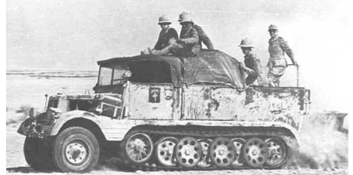
British troops reach Homs just short before the German motorized advance elements

An Italian task force lead by the new Italian battleship Littorio bombarded the British supply lines from off the shore. The British forces had no choice but to withdraw from the small town. The German army has therewith successfully relieved the besieged Italian colony Tripolis with their hastily assembled forces in Africa.