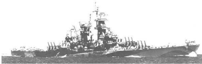
BB Texas was damaged in action

Commencing the declaration of war on Germany, the US Atlantic fleet set out with four task forces to protect international shipping in the Atlantic, mainly between Britain and America, from German raiders.