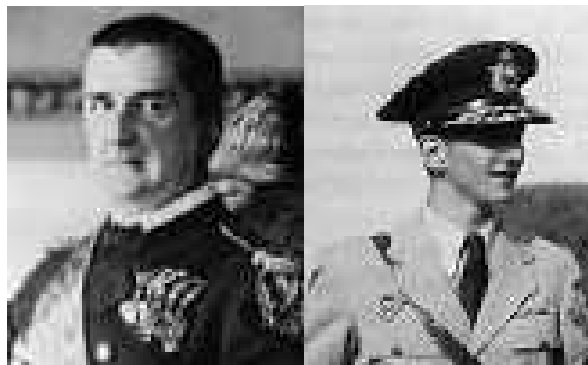
Hungary's Van Horthy (left) and ex-Yugoslavian P.M. Cvetkovic (right) were invested with top military offices in their respective nations

The peace treaties following the Balkan Wars of 1912 and 1913, World War I, and the Greek-Turkish conflict ending in 1923 resolved the frontiers of the various Balkan states until 1939. In that year, Italy occupied Albania and proceeded to implement her designs for dominating the Balkan Peninsula.