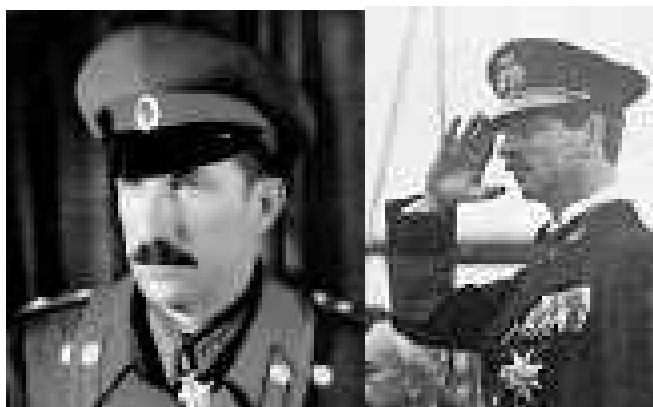
Tsar Boris III of Bulgaria (left) and King Carol of Romania (right), supreme military leaders

The Balkan peoples have been in contact with the inhabitants of Asia Minor, the Hungarian Plain, Central Europe, and the highly developed Mediterranean civilizations for thousands of years. Nevertheless it is still possible to distinguish such ethnic groupings as the Albanians, Serbs, Bulgars, Turks, Greeks, and Vlachs, the last a seminomadic race of herdsmen being absorbed gradually into the various national states into which the Balkan area is divided.