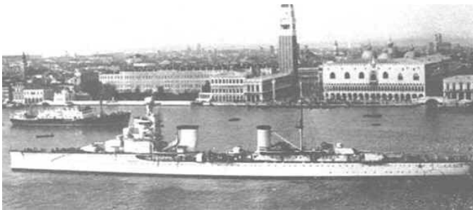
Alberico da Barbiano, here before the silhouette of Taranto, was sunk by British torpedo planes

By 4th of August the German forces completely secured the airfield. The rest of the corps was then directly flown into the airfields to deploy until 7th of August. At the same time an Italian assault fleet sailed out from Taranto, carrying German troops on its way to Bone. At 10th of August the I. Fallschirmkorps secured Bone port. On the next day the assault fleet arrived at Bone, beginning immediate disembarkation of the German Heeresgruppe Afrika.