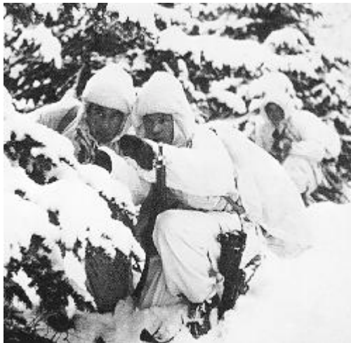
Finnish patrol at the Mannerheim Line

Helsinki. Not without surprise, Russia made her threats to the ex-Duchy of Finland real. On 30 th November the first Russian troops crossed the border, and on 1 st January Russian forces launched an assault all along the front, prepared by intense shelling by artillery, naval ordnance in the bay of Leningrad, and bomber aircraft. After the battle in the sky went fortunate for the Russians, the bulk of Russian armed forces concentrated in the 1 st Tank Army pushed through the Finnish defenses at the Karelian Isthmus. The thrust could only be stopped short before Wyborg, where strong Finnish reserves had been prepared behind the so-called Mannerheim Line, a line of fortifications with infantry bunkers and shelters that have been secretly installed during the last three months.