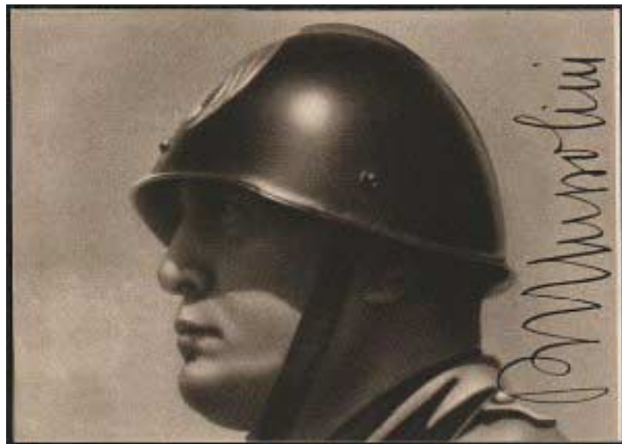
Signed postcard from Benito Mussolini

Benito Mussolini, "IL DUCE", Prime Minister of Italy, is an Axis European political leader. Like Hitler, he served in the First World War as a young man and dreamed of military glory in a Second War to come. Both returned from the First World War to find their countries in political and economic chaos and formed extremist political parties.