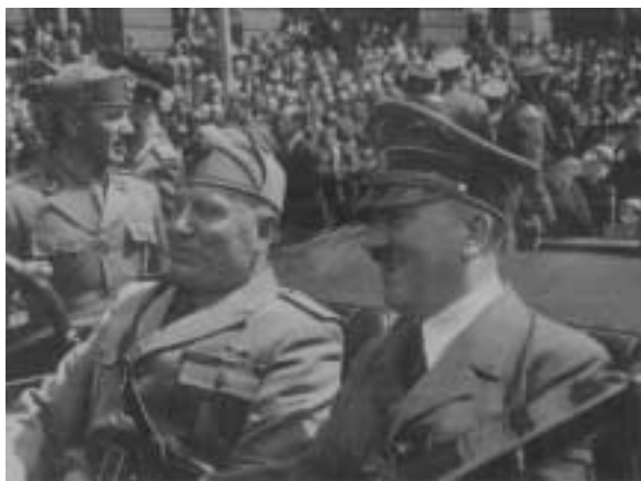
Mussolini with Hitler

Mussolini's rise to power was rapid; his Fascist Party Blackshirts marched into Rome in 1922, a year before Hitler's failed first attempt to seize power, the Munich Beer Hall Putsch, landed the German in prison. By the time Hitler became the Fuehrer (Leader) of Germany, Mussolini had been "IL DUCE" (Leader) of Italy for more than ten years. He had been successful in improving the Italian economy and bringing stability, as it was said, "He made the trains run on time" (by shooting someone if they didn't). His ambition was to regain for Italy the prestige and power.