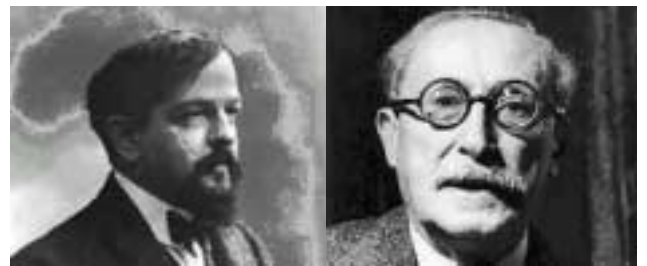
Left: Prime Minister Maurice Thorez. Right: Foreign Minister Léon Blum

political struggles that have shaken France since the world economic crisis. This time the communists under Thorez form the largest faction in parliament. The communists started their campaign under the motto 'peace and freedom for all people'. As his first official act, Thorez asked the British Expeditionary Force to leave French soil, expressed the friendship of the French people with the Russian brothers and demanded excuses for the German aggression. 'We thought that Herr Hitler had promised us to keep Alsace-Lorraine for all times. If he is a man to be trusted, I call him to sign a peace treaty with the Republic of France', said new Foreign Minister Léon Blum after his office oath.