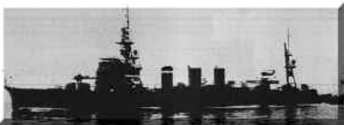
Japanese cruiser in the waters around Shanghai and Hangchow

Southern China was again the scene of heavy fighting between the Japanese Kwantung army and the forces of the national Chinese, or Kuomintang, government. The Japanese launched a heavy assault on the Chinese city of Hangchow. The Japanese pulled off a Nanking-style combined land-air-naval assault by units from all service branches. The Chinese defenders managed to blunt the attacking wedge of the Japanese assault. The Japanese, who could not risk bleeding out all their forces defending Changchou and Shanghai, halted their offense after first severe initial losses. In a concerted action, Japanese forces also attacked north of Amoy, south of Wuhan and in the Canton area. At Canton, the Chinese were able to launch a counterattack, but failed to make any substantive ground. The Japanese claim to have pierced the Chinese ring of defense at Amoy. Western analysts already speculate whether this could mean further territorial gains in southern China.