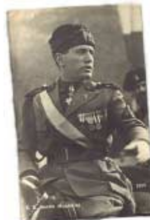
Mussolini as a young officer

These facts must be taken into consideration when judging the peace appeals of a man