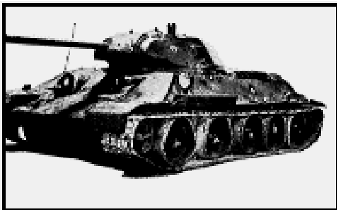
Russian tank in the Karelian snow

The Finns claim that despite severe losses on their own, after they successfully attacked supply dumps near a Russian HQ, winter has finally taken its toll from the Russian attackers, which were far too numerous to find housing and shelter in the largely uninhabited Finnish forests.