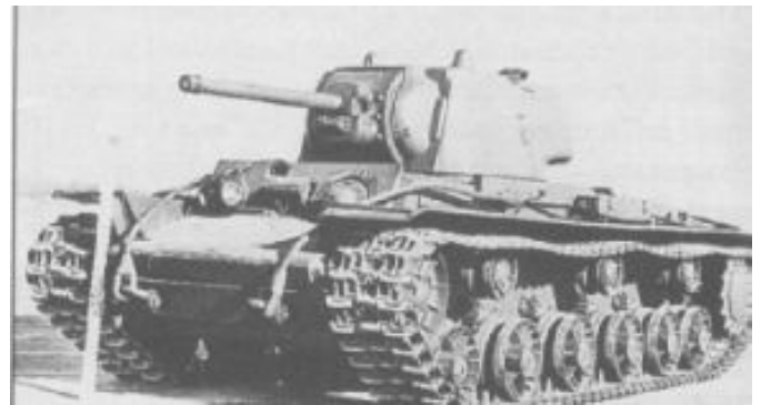
Soviet heavy tank KV-1, one of over 1200 pieces in the 2 nd Tank Army

On January 2 nd , the Soviet Central Front under Commander-in-Chief Marshal Georgi Konstantinovich Zhukov crossed the border to the neighboring country Romania with a total of 57 divisions. The disputed territory of Moldavia is claimed by Soviet Russia since 1922 and was occupied in a swift move. Romanian border battalions were quickly overrun. The Soviet troops advanced to the claimed borders of before 1920.