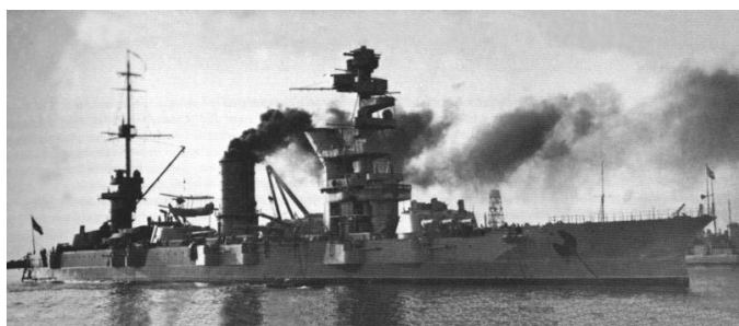
BB Marat, sister ship of Oktabrya Revolutsiya

Both sides reported heavy casualties upon the other. The Germans admitted to have retreated into the fog after realizing unfavorable odds against the Soviet battleship.