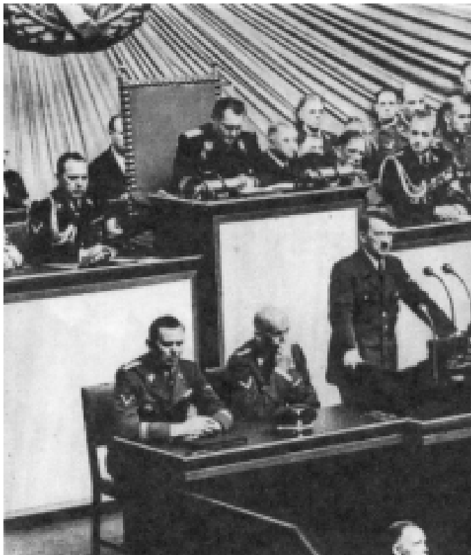
Hitler's New Year's speech before the Reichstag

Millions all over moaned a sign of relief as the prime ministers, chancellors and presidents of Great Britain and several Axis pact nations announced a peace treaty between Britain and Germany on their New Year Speeches. With the fullest consent of her Allies, Germany had prepared and signed an agreement that might change the world not less than the treaties of Versailles and Vienna.