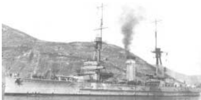
The 20,000 ton battleship Espana sunk after taking several hit from French guns

The Spanish Armada attacked a French convoy bound for the African colonies the mediterranean island of Mallorca in the morning of July 18 th . Three French battleships escorted the troops transports fully loaded with soldiers escaping from Marseille. In other circumstances, the aged Spanish navy would have been no match against the modern and large French fleet. But three French dreadnoughts against an entire fleet with more than 50 ships from destroyer to WWI-style battleship was like a bull facing a pack of wolves. By their superior armaments, the Jean Bart, Provence and Strasbourg sunk the two Spanish battleships Espana and Jaime I. But Jean Bart was hit in the ammo bunker and exploded. Provence was severely damaged and skirted out. Strasbourg managed to increased range during battle while the Spanish destroyers tried to evade the French battleship to get at the transports.