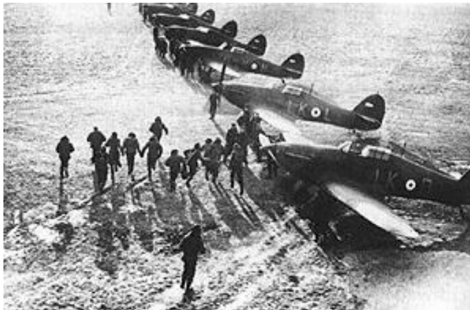
French pilots in Dijon run for their last scramble to evacuate south before the advancing Germans

Leaving mainland France between July 16 th and 31 st , the triumvirate of French military chiefs - De Gaulle, Weygand and Admiral Darlan - declared their unshakeable will to continue the fight against Germany, Italy and Spain 'until all French soil is void of enemy boots'. French troops occupied all governmental buildings in the colonies, installing a military government. British troops aided de Gaulle by occupying French Somaliland. Only Tunisia, Central Africa and Syria remained loyal to the mainland French government. In Syria, rivaling troops of 'De Gaulle' and 'Petain' followers crashed in a fight over the prefecture office in Damascus.