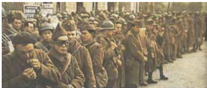
800,000 French soldiers were taken as prisoners of war in the Belgium and northern France

The German armies surrounding the joint Anglo-Belgian defended strip of Belgium launched a massive attack against the retreating allied forces. A total of four German armies, three of them armored or mechanized conducted the offensive. 10. Panzer-Armee attacked Brussels, while 3. Panzer-Armee, 2. and 6. Armee assaulted Antwerp with support by large Luftwaffe formations.