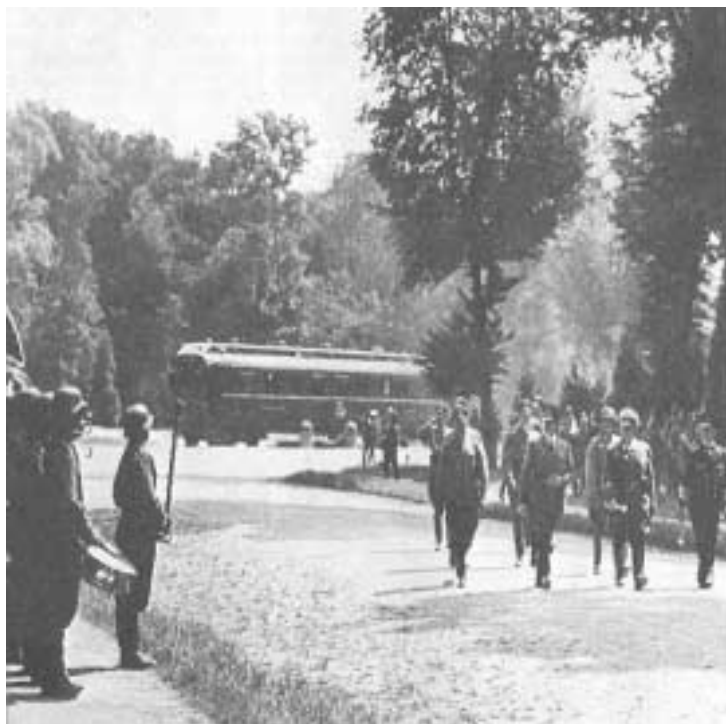
Hitler and his generals leave the monument erected to the armistice erected in the forest of

The new French government under Marshal Pétain signed the peace treaty with Germany in the forest of Compiègne on July 15 th , after almost the entire French army was captured by the Germans. Marshall Pétain resisted the parts 4-6 of the contract. He expressed his doubts as to whether Germany could guarantee the Spanish retreat from center France. At the date of signing, the designated new capital, Vichy, was still occupied by Spanish troops. Spain unilaterally declared the annexation of the province of Gascogne, south-western France. The treaty calls for a Spanish occupation zone in Southern France, cutting from all their colonies. Meanwhile the Maginot Line forces under General Weygand attempted an all-out breakout to the south. Many French soldiers died in the hopeless battle against superior strength, supply and air support. Ca. 300,000 of the 1 million strong Groupe Armée 2 succeeded in evading the enemy, making it south to the vicinity of Marseilles, where De Gaullist troops have rallied together to escape to the colonies. When the pocketed French troops finally surrendered, Marshal Pétain signed the treaty. 'It is better than nothing', he said later. 'All I can hope for is that Germany will keep her promises'.