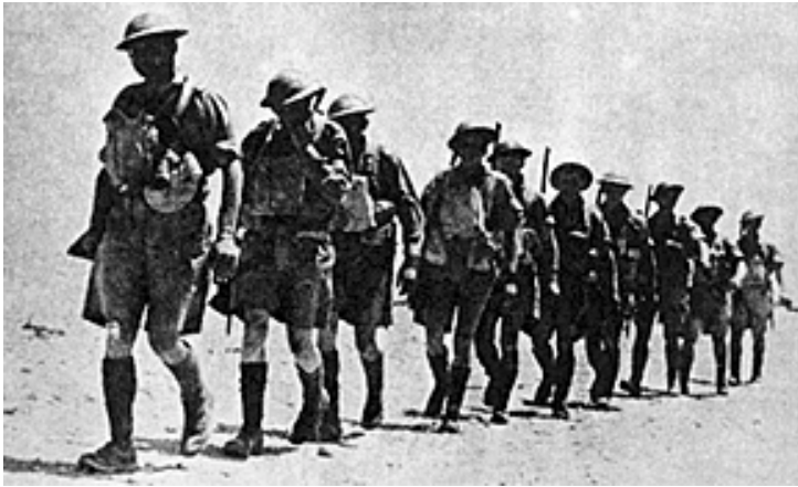
British infantry march across the desert

Meanwhile, a joint attack by British Armored, Canadian and Indian Corps was launched against the Italian beachhead.