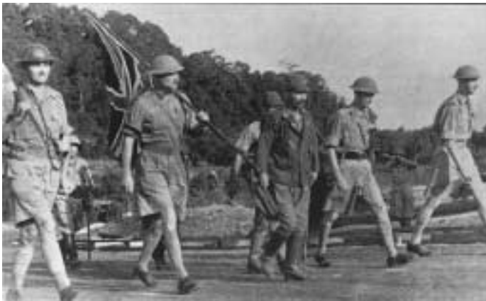
Singapore surrenders to the Japanese

On the 16 th of July, Japanese Marine Divisions attacked the city of Singapore with shore support by Imperial warships. Japanese aircraft attacked to harbor and destroyed many British merchant vessels. The British were surprised by the unsuspected and insidious strike. Three Japanese divisions landed on the jungle beaches at the perimeter of the town, establishing a firm beachhead. The sole British division surrendered after a short but intense battle.