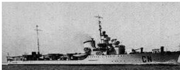
Light cruiser Camicia Nera will sail no more

On 6 th of July, an Italian convoy left Tobruk for Taranto in an attempt to sneak past the British fleet in SZ 95. The British, expecting such movement, have been highly alert, spotting the convoy 75 miles west of Crete Island. The British force numbered two battleships and at approximately 25 cruisers of various classes. The Italian convoy consisted of several hundred transport ships protected by 40 destroyers and four heavy cruisers. The British Admiralty has released the following report to the press: The Italian destroyers faced the British force to delay them and launched a spray of torpedoes on the attacker. In the dark, the torpedoes were difficult to evade, hitting the slow monitors Erebus and Terror. The British cruisers concentrated their fire on the Camicia Nera and her sister ships, destroying them at long range. Duca d'Aosta fled with the transports. The British task force chased the Italian fleet through the central Mediterranean. When the Italians split up, the British commander had to make a decision, but was unaware of how many transports each force escorted. He opted to split his force, too, taking a great risk in the attempt to prevent the escape of all Italian transports. The British heavy cruisers followed the Turbine/Maestrone, the light cruisers followed Duca d'Aosta. The Italian destroyers increased distance to the British cruisers and managed to escape.