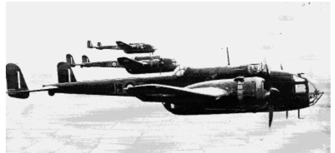
Picture: British HP-51 Hampden Bombers from the 5 th Bomber Wing, Birmingham, on mission over Belgium.

Hundreds of British two- and four-engined bombers bombarded the city of Antwerp this month. Prime target were the factory district and key infrastructure elements. At day, escorted bombers launched low altitude pinpoint strikes at assorted industries. At night, Stirling heavy bombers attacked the burning targets from the day raids. German fighters intercepted the British intruders and a massive air battle resulted. Both sides reported daily kills of 10-20 over the severely contested skies of northern Belgium.