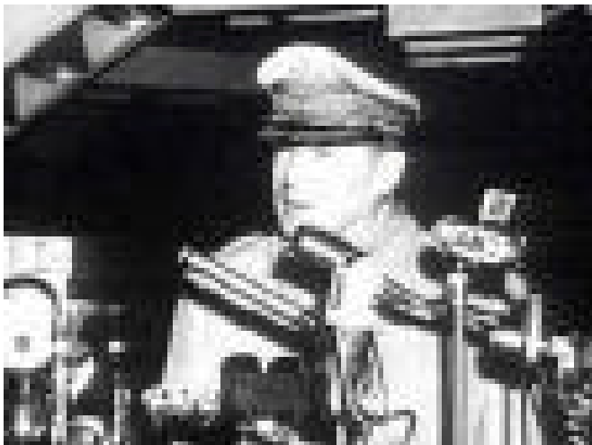
General McArthur speaks before the press

The Royal Navy struck back at the nefarious forces of nazi evil in the Atlantic by sinking over 30 German submarines in the Atlantic off the French coast, showing that she still was a force to be reckoned with. Most encouraging was the fact that these subs were sunk before they could even reach merchant lanes. Rumor has it that war hero Kretschmer,