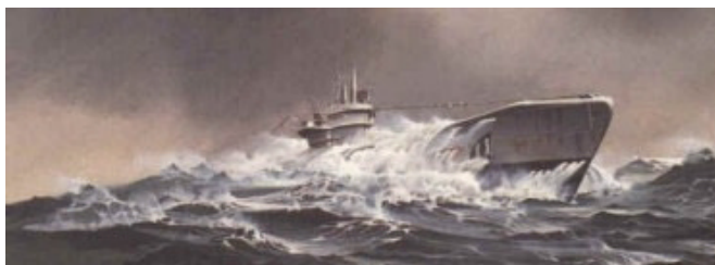
German submarines are facing rougher seas

German submarines operating in the high seas of the Atlantic managed to sink in a matter of minutes an entire convoy of ships of the coast of Lagos heading for the Cap before disappearing unscathed. Sailors on the HMS Exciter, a 10,000 ton supply ship, managed to board their life rafts in time and row to the coast where they were generously treated by local villagers until they could be repatriated home. One eye witness said that German subs had the luxury of surfacing to finish them off with surface gunnery, much to his disgust.