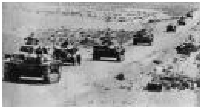
German panzer columns on the advance

British and French forces in French North Africa continued to pull back from Tripoli in order to protect Tunisia, Algeria and Morocco from the German troops landed in Bone a few weeks ago. British columns have come under incredibly intense air attacks from Axis forces, leading to the decision of abandoning if necessary much of their motorized and armored equipment. Many platoons of Mathilda's have reportedly been left behind or destroyed.