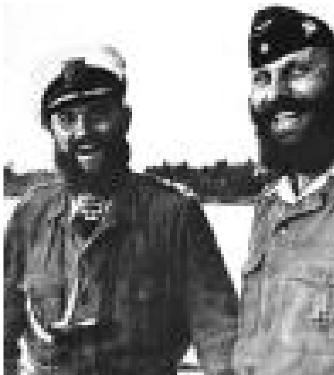
Kretschmer with unidentified fellow officer

captain of the U – 201 flotilla perished in the disaster. If his death is confirmed, it will be a welcome sign to British citizens whom Herr Kretschmer, credited with the greatest success in the present U-boat campaign, deprived of many basic necessities. However the German U-boats had not said their last word.