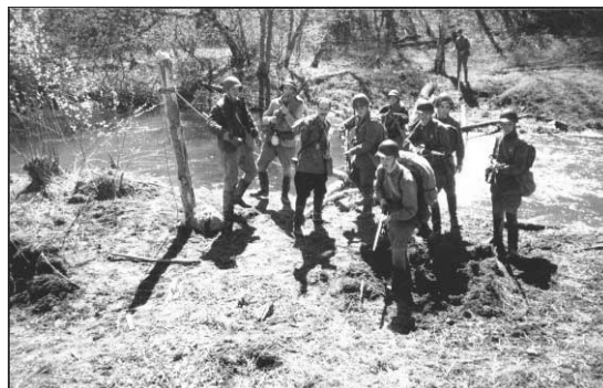
Lead recon' units cross the border on the 1st of the month.