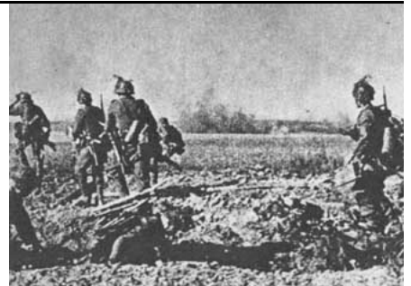
German infantry advancing from the Pripet Marshes.

Soviet infantry quickly broke and fled the lines, with Polish troops covering their rear. In bitter fighting the Germans and Poles took no prisoners, but it was the Germans, with overwhelming armoured and air support that forced the issue, reports indicate that less than 1,000 Poles survived the final stand by