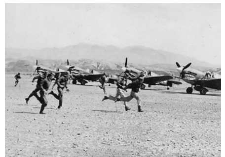
American and British pilots take to the air to defend southern China

With talk of a British attack upon Siam and relief forces on route from Australia and Europe the defenders of Indo China are confident that they will turn the tide.