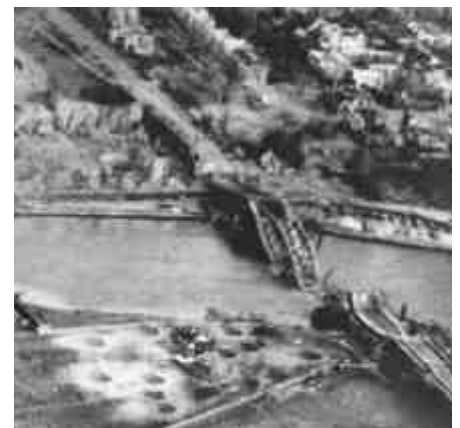
Dutch troops destroy the Arnhem road bridge in a last effort to hold the German advance, to now avail.

The deciding factor in this action has been the ability of the Germans to move quickly and with overwhelming force, whilst providing continued top class fighter aircraft to their pilots, this combination has now seen the demise of France and the destruction of the Lowlands.