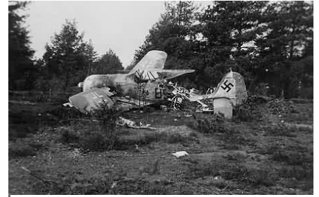
One of the few new model German fighters shot down over Holland.

As these five divisions prepared to pull south, news reached them that the city of Arnhem was being pounded from the air by the Luft-