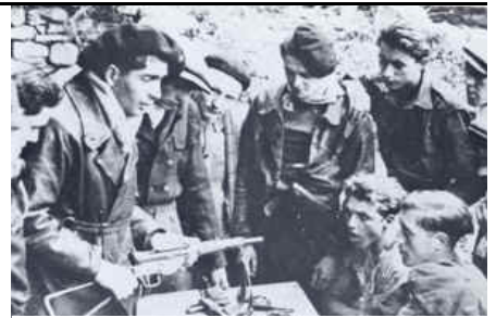
French troops near Bordeaux hear of their governments surrender.

confused, key elements of the French Fleet sailed into Nice and Genoa as per their surrender terms, whilst a number of cruisers and other vessels have been seen entering Allied ports.