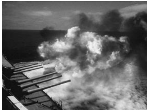
Japanese Battleship Bombards Indochinese Coast

This action also opens yet another front against Chiang's KMT, forcing him to stretch his front lines even thinner, in his vain hope to cling to the power he has abused for far too long. Soon the only avenue of outside assistance for the KMT would be the long, twisting, and perilous "Burma Road", a tenuous link at best through the Himalayan Mountains.