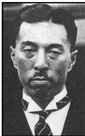
Prince Konoye Fumimako

Today, we strive forward to answer that question. With the divine guidance of His Majesty, Emperor Hirohito, and the fine leadership of his government, our full confidence is in success. The whole of free Asia is counting on it!