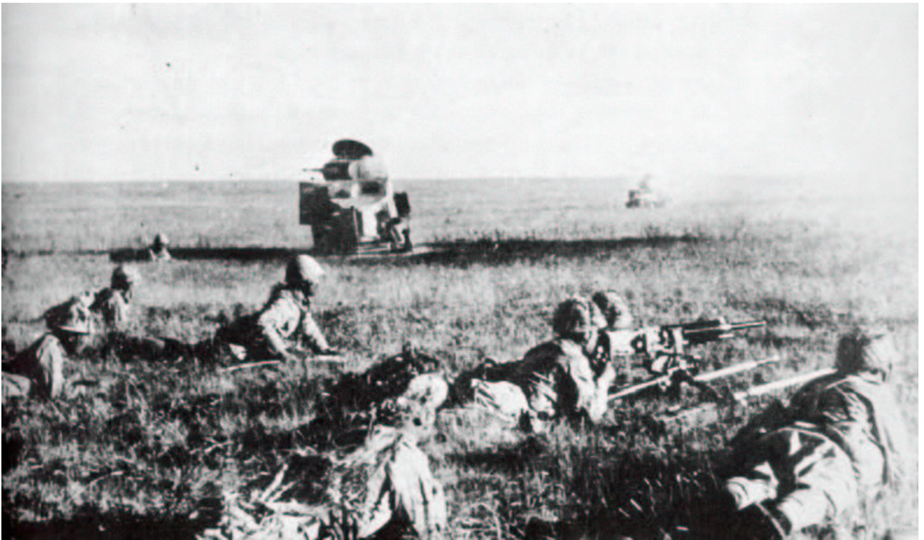
Imperial Forces make final drive on Huhehot