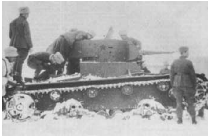
A Soviet T-26 Model tank undergoes minor repairs on the Zhitomir front.

On the Eastern Front, the "Zhitomir Pocket" of German troops in Russia was fully liquidated this month, despite German efforts to relieve them. It seems that the strange events in Moscow were unable to prevent Red Army troops from fighting effectively on the front lines. German troops did make some progress along the overall front; however the loss of the troops in the pocket will likely be felt by German High Command for many months, and will possibly nullify the positive effects of these gains.