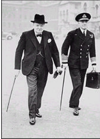
Admiral Sir Pound and Mr Churchill in London