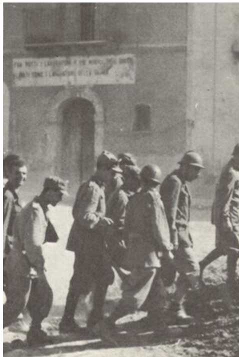
Italian POW's heading for the ships in Tobruk after their release The smiles of relief are there for the entire world to see.