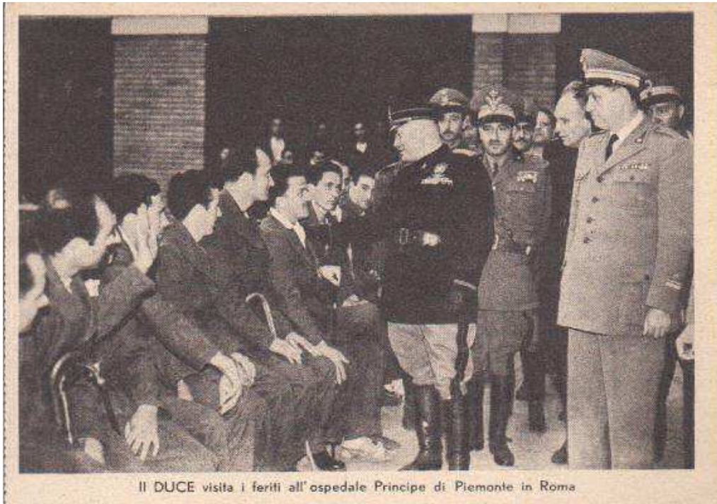
IL Duce speaking to some of the rescued and injured PoW's in Italy