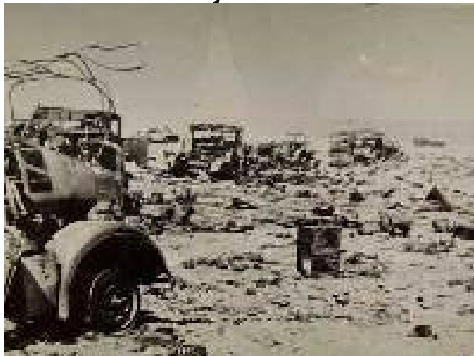
Remains of British equipment and supplies outside Tripoli

The North African army is now at the gates of Tripoli! After several weeks of hard fighting in which we have completely destroyed several British divisions, including an armoured unit, our forces are now at Tripoli. Rumours in the town say that the British are brutally repressing the population as they are desperate for the Italians to return. Reports of summary executions, beatings, torture and robbery are coming out of the town. We are informing the rest of the Muslim