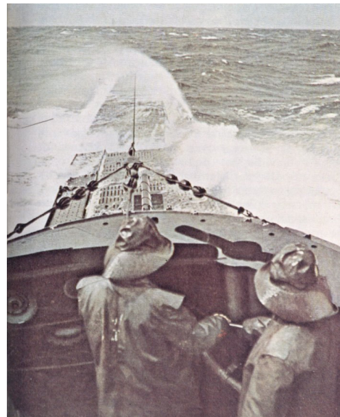
German U-Boat in the Atlantic

Admiral Raeder went on to mention how hard it is to tell the nationality of a vessel looking thru the periscope or from a deck of a warship.