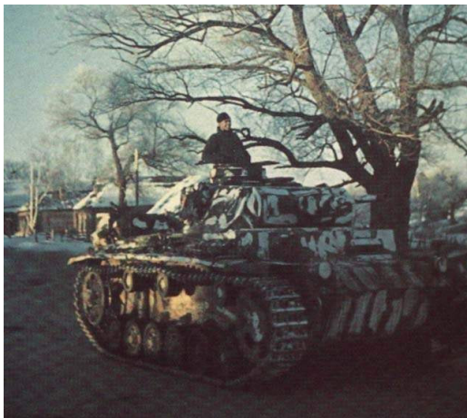
PZ III in Russia

The loss of this city can only be described as a major blow to the Russians as it opens much of the south to advancing German and allied armies.