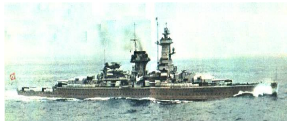
Admiral Scheer in the Atlantic

In the ensuing battle several British Cruisers were reported to be heavily damaged. Most of the British shots were reported to be wildly inaccurate and the few that did manage to hit bounced off the ships superior armor.