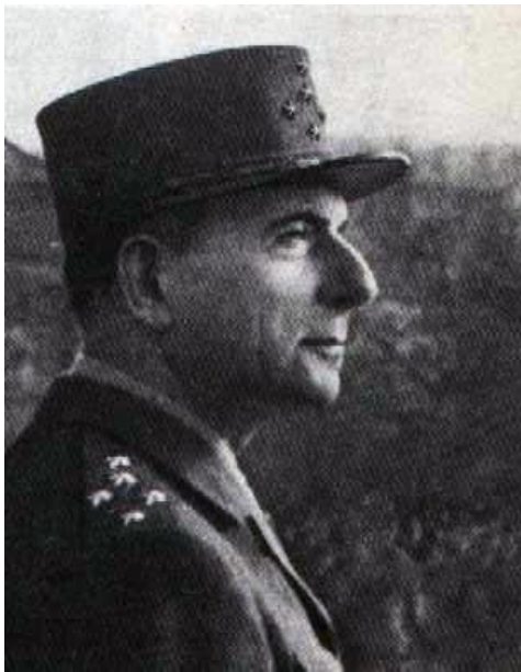
General de Lattre de Tassigny, CO FFL

Our guys are ready for the next operations. The Spaghettis are going to feel the ..." For the sake of young and sensitive people, we had to censor the end of the sentence. In any case, morale is high and the troops are ready.