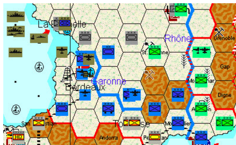
Southern France — the Battles rage

The question will now arise if the British are prepared to throw more troops into this operation, perhaps if they do they will consider using troops that are better suited to amphibious warfare. However they must also consider the fate of the Home Fleet, can it remain on station so near the growing u-boats threat?