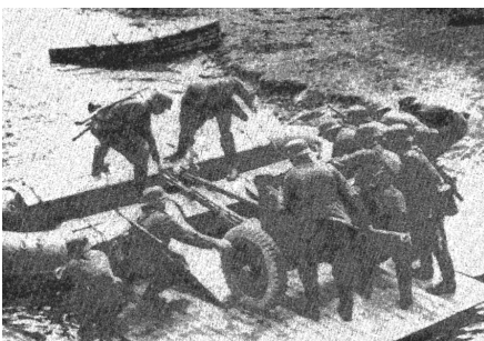
German infantry cross under heavy fire from Russian Infantry

German forces moved the main thrust of their drive towards three key cities this month, pushing towards Kiev, Smolensk and Odessa, in three independent drives through the hear of the Russian lines.