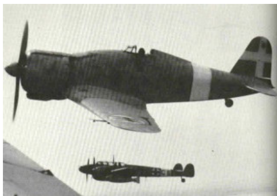
Our fighters and bombers on their way to pound both British and French positions time and time again with no losses.

Massed air attacks spell doom for the British convoys in North Africa. Despite their denial we can announce that the British forces in Africa are finding life hard under the sun and bombardment of Italian airmen. We have successfully engaged the remnants of the British Airforce, fought off the French in the North, with a brave unit holding of six French divisions who have been almost destroyed thanks to the accurate gunnery and esprit de corps of the excellent Italian forces arrayed against them.