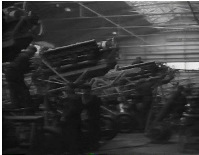
An armaments factory in full swing.

FOLLOWING MASSIVE INVESTMENT THE GOVERNMENT ANNOUNCES A GREAT BUILDING PROGRAM FOR THE ARMED FORCES.