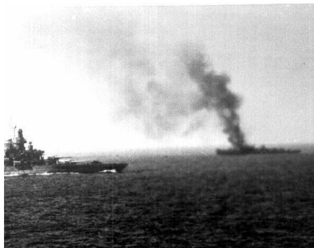
The Fleet as it sails past 1 of the 3 British Cruisers it destroyed