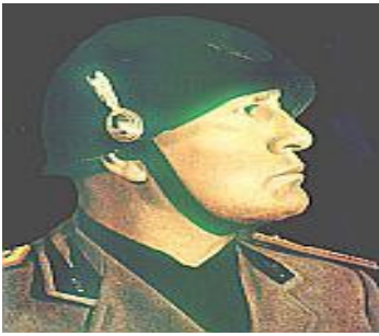
"The function of a citizen and a soldier are inseparable" Mussolini 1940