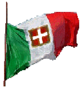
"Believe, Obey, Fight"