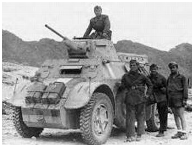
A recon section takes time to rest from chasing the British as they flee south in North Africa.

Massed air attacks spell doom for the British convoys in North Africa. Despite their denial we can announce that the British forces in Africa are finding life hard under the sun and bombardment of Italian airmen. We have successfully engaged the remnants of the British Airforce, fought off the French in the North, with a brave unit holding of six French divisions who have been almost destroyed thanks to the accurate gunnery and esprit de corps of the excellent Italian forces arrayed against them.