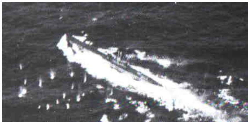
A French submarine being attacked. It was later sunk.