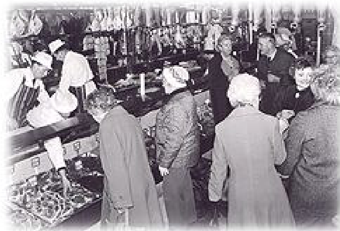
The people enjoying the end of rationing and the bountiful array of food on offer now.

We have all thought there seems to be more food in the shops haven't we? Well it's because IL Duce has agreed to end the rationing of foodstuffs for Italy and our allies in Rumania and Bulgaria! So whilst the Brits starve we can eat as much as we want!