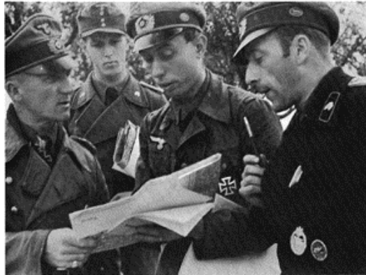
German officers planning their next move in Spain.