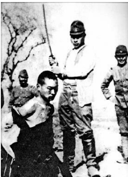
Japanese troops behead a Chinese rebel leader outside of Tsinan.

Luckily the KMT and CCP forces appear to have done little in the way of offensive operations, allowing the Japanese to worry only about their rear area and leave troops on the front to rest and recover after one of the most successful military advances in the nation's history.