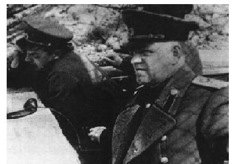
Zhukov west of Moscow.

Will Zhukov have acted quickly enough, only time will tell, will he manage to force a hold in the German onslaught long enough to muster his troops, we think unlikely and await the next coupe!