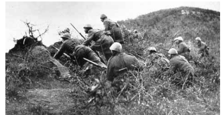
Greek infantry take up positions to the east of Xanthi.

Greek formations are believed to have held their movement north following the deployment of a number of Italian divisions onto their northern border.