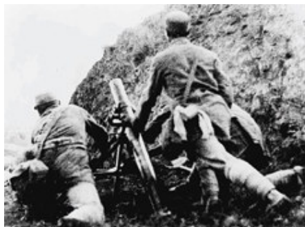
The new breed of KMT Regulars

Chungking, the main administrative centre for the KMT. Further East KMT forces, although taking heavy losses also managed to hold onto the strategically important city of Ichang, facing enemy attacks from 3 directions. Recent improvements in the KMT field