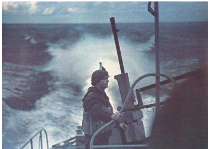
German E-Boat ready for battle

Initial reports confirmed the loss of three British cruisers and approximately twenty destroyers. When daylight broke units of the British Coastal command based in England and occupied Norway strafed and depth charged German E-Boats and U-Boats. German losses have been reported as extremely light with some E-Boats shot up and the loss of a captured Russian sub flotilla.