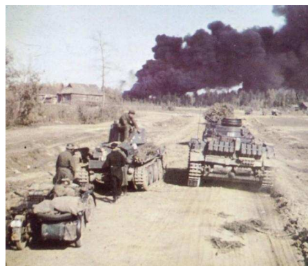
German Armor in Spain

Combined forces of Germany, Italy, and Spain continue the push to remove the British invaders from Continental Europe. Some 50 divisions continue the chase as British troops on the run leaving behind the remains of a once proud Portuguese army. Elements of allied forces are reported to be on the outskirts of Lisbon and nearing Gibraltar. Food, fuel, and ammunition are reported to be in short supply by the soldiers captured by advancing forces.