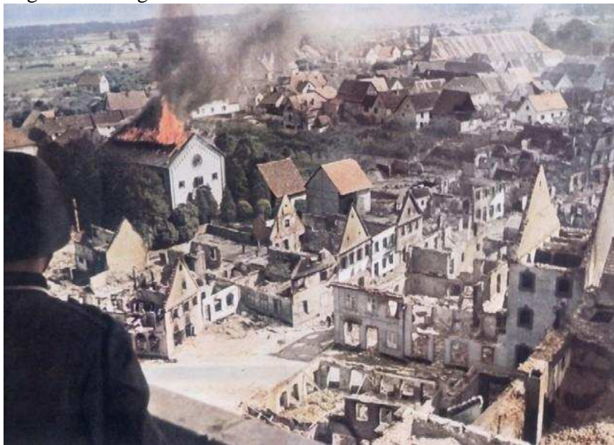
Outskirts of Antwerp

If these acts of barbarism continue the German Luftwaffe will have no choice but to make England an island of fire and devastation. One does hope however that the criminals in England will stop targeting civilian targets.