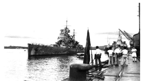
HMS Duke of York returns to harbour.

With the campaign in Greece stalled and the loss of key assets of the fleet the Italians must again look at how they are conducting their war and consider if their strategy is working.