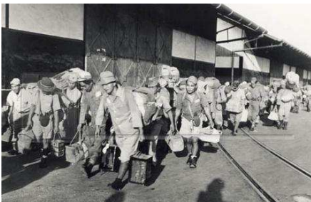
Japanese troops pulled out of the front line, board transports in Haiphong harbour, as the British close in.

With the evacuation of these forces the Japanese will have freed some 12 to 18 divisions for service in China and Manchuria, so the strategic value of this withdrawal may be seen elsewhere in the region, it still however marks the first Allied victory in Asia.